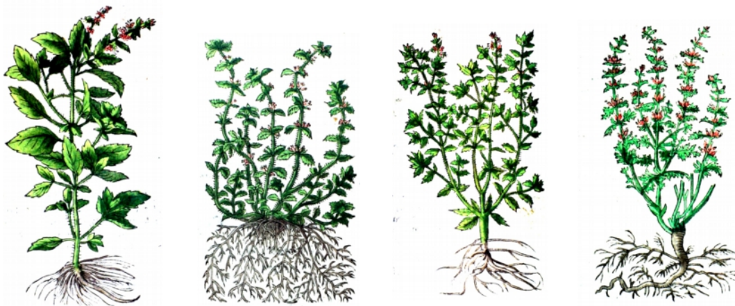
Ocimum basilicum, Cruijdeboeck Rembert Dodoens, 1554

The communities in both cities are juxtaposed in a multilayered visual representation. The ecological approach, the habits and traditions are analyzed in a simple and transparent language. There is no intention to judge, but rather to show the -still- enormous diversity in a globalising world. The goal is to transmit the power generated by bottom-up and self-organized communities, to get energized by it.