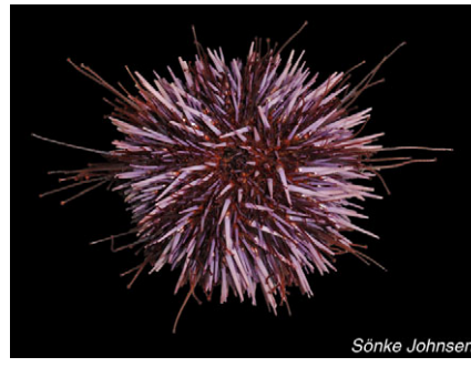
Yerramilli and Sönke Johnsen from Duke University explain that if this is the case, sea urchins with densely packed spines will have better vision than sea urchins with sparsely packed spines, so they decided to test the vision of Strongylocentrotus purpuratus sea urchins, with tightly packed spines, to find out how well they see (p. 249).

Placing individual urchins in a brightly lit arena with a 6 cm or 9 cm diameter dark disk on the arena's wall, the team viewed the shadows of the moving animals from beneath the arena's white floor. Would the sea urchins see the disk and respond to it, or would they be oblivious to the disk's presence? Recording 39 urchins' responses to the disk at different positions around the arena's perimeter, the duo saw that the urchins wandered randomly around the arena when the 6 cm diameter disk was in place; they didn't respond to it. But it was a different matter with the 9 cm diameter disk; the urchins either raced toward it or fled in the opposite direction.